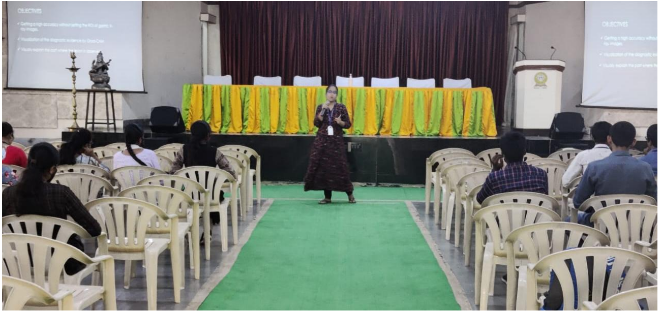
Students in the event